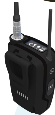
VOKKERO® GUARDIAN PLUS