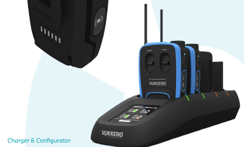
Charger & Configurator

CHARGER > Charger & Configurator with touch screen for intuitive configuration